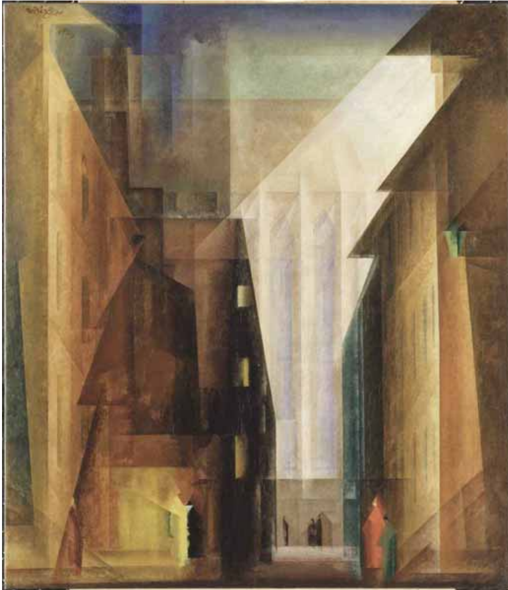
Lyonel Feininger American, 1871–1956 Barfüsserkirche II (Church of the Minorites II) 1926 oil on canvas 42 3/4 x 36 5/8 x 2 1/2 in. Collection Walker Art Center Gift of the T. B. Walker Foundation, Gilbert M. Walker Fund, 1943