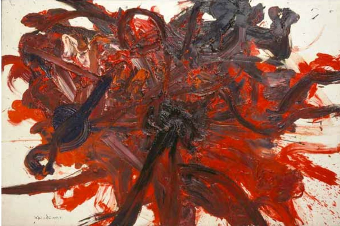
Kazuo Shiraga Japanese, b. 1924 Untitled 1959 oil on canvas 70 7/8 x 110 in. Collection Walker Art Center T. B. Walker Acquisition Fund, 1998