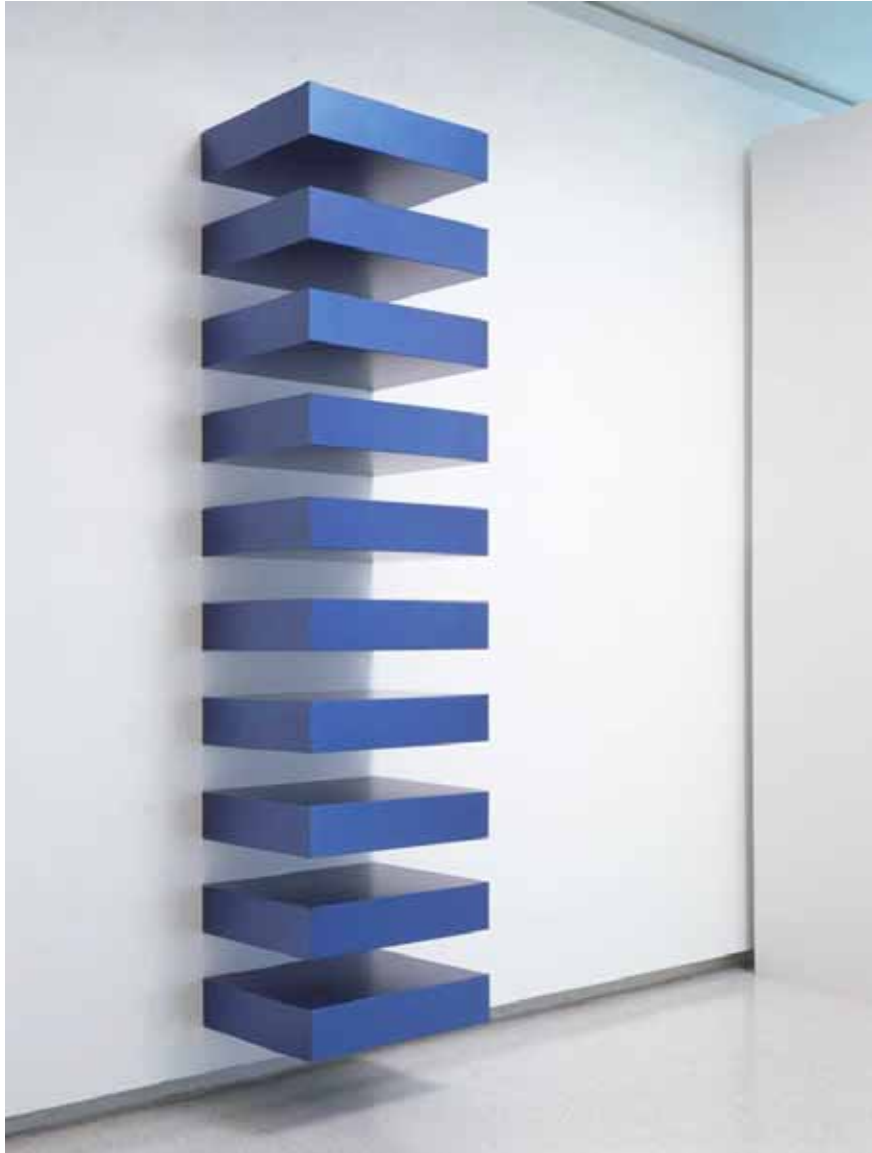
Donald Judd American, 1928–1994 untitled 1969/1982 anodized aluminum 10 boxes; 6 x 27 x 24 in. each Collection Walker Art Center Gift of Mr. and Mrs. Edmond R. Ruben, 1981