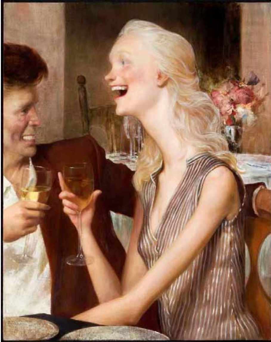
John Currin American, b. 1962 Park City Grill 2000 oil on canvas 38 1/16 x 30 x 1 7/16 in. Collection Walker Art Center Justin Smith Purchase Fund, 2000