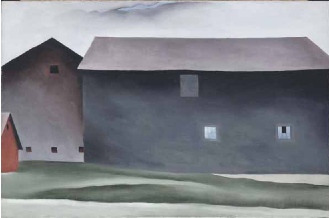
Georgia O'Keeffe American, 1887–1986 Lake George Barns 1926 oil on canvas 21 3/16 x 32 1/16 x 1 15/16 in. Collection Walker Art Center Gift of the T. B. Walker Foundation, 1954