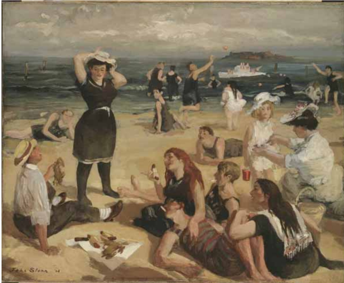
John Sloan American, 1871–1951 South Beach Bathers 1907–1908 oil on canvas 31 13/16 x 36 x 1 1/4 in. Collection Walker Art Center Gift of the T. B. Walker Foundation, Gilbert M. Walker Fund, 1948