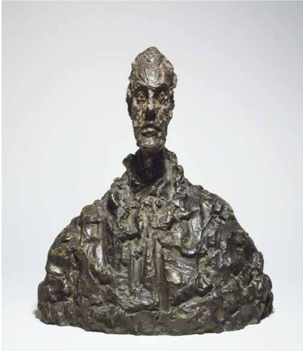
Alberto Giacometti Swiss, 1901–1966 Buste de Diego (Bust of Diego) circa 1954 bronze 15 1/6 x 13 1/8 x 7 5/16 in. Collection Walker Art Center Gift of the T. B. Walker Foundation, 1957